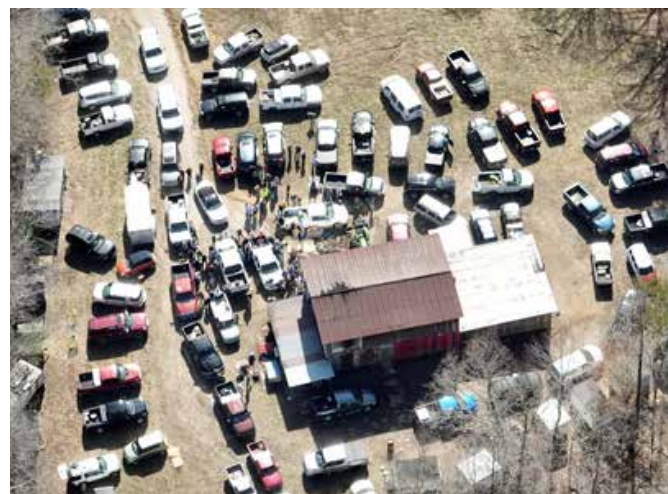
HFA's investigation results in raid at this Tennessee cockfight. Multiple individuals were charged.

Over the past three years, we've provided authorities with undercover videos, the schedules of upcoming fights, names and photos of pit managers, and drone footage of cockfight venues. The biggest obstacle HFA has faced in our battle to eliminate cockfighting has been local law enforcement's